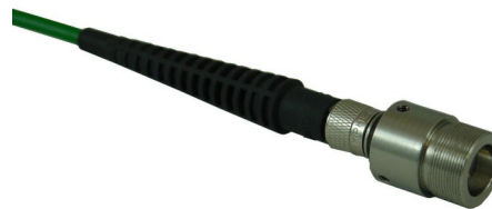
Fiber patch cord not included

The full field of view (FOV) or full divergence angle can be calculated as FOV = 2\arctan(D/2f) where D is the fiber core diameter and f is the focal length of the lens. Alternatively, the linear field of view on an object placed a distance L away from the collimator is D(L/f) .